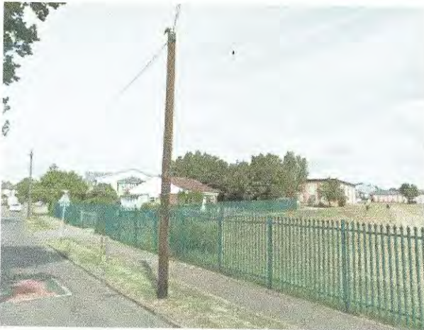
LOCATION B WITHOUT POLE