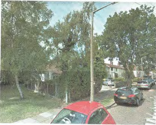
LOCATION A WITHOUT POLE