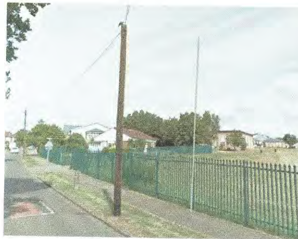
LOCATION B WITH POLE