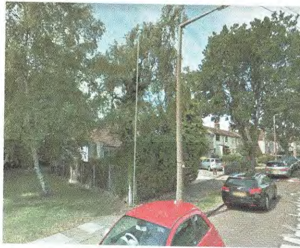
LOCATION A WITH POLE